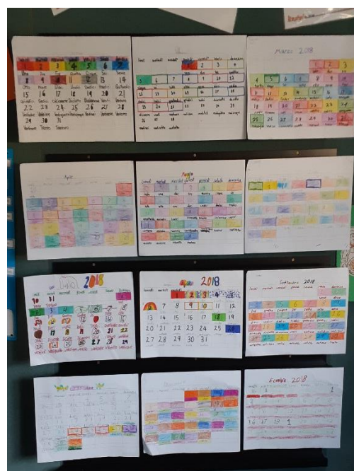
3/4 Ruby's Calendar