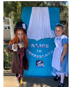
The Library Crew