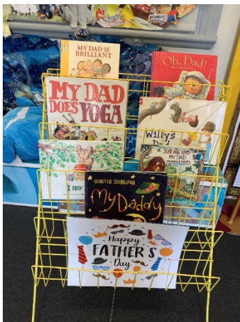
Happy Father's Day!!