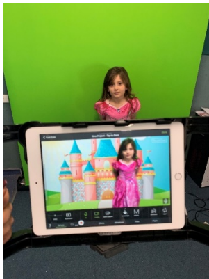
Taking the opportunity to use the filming kit while the students were in character.