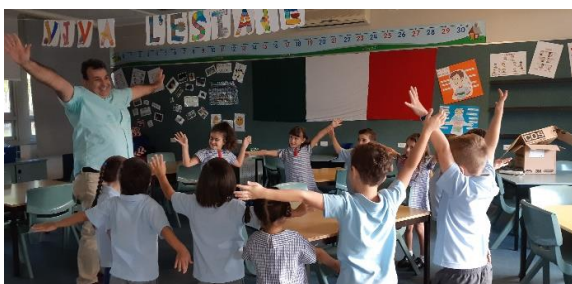
Kindergarten learning Italian greetings through song.