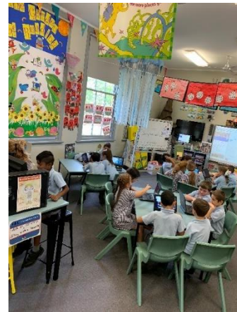
Students from 1/2 Ocelot looking at Google Maps and Atlases to discover more about how we can draw a map of our school.