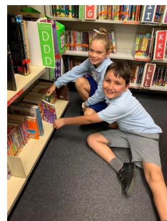
Library Monitors getting ready for Easter Displays and helping students in the library.