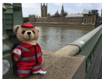
British Houses of Parliament