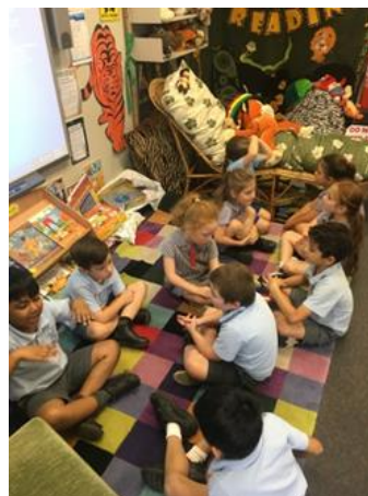
Students from KE are describing what their home looks like and what they have to do to look after it.