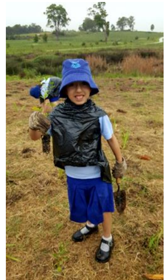
Schools Tree Planting Program Western Sydney Parklands at The Dairy