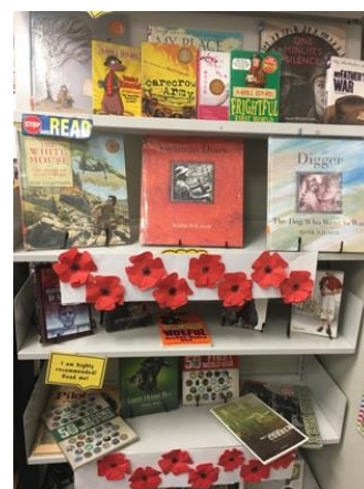
Library Remembrance Day Display