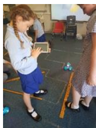
Students in 3/4 Ruby creating their Winter Hats and working in the technology room with DASH!