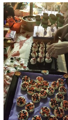
Halloween Disco Fun