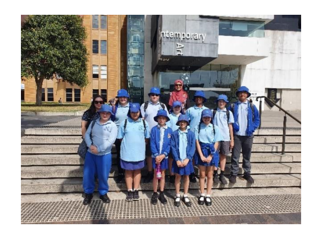
Year 6 Fun Day -